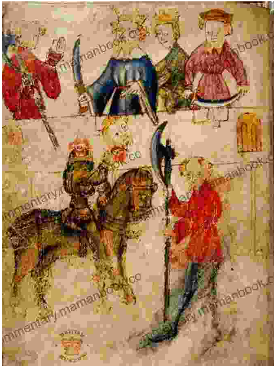
Manuscript illustration of Sir Gawain beheading the Green Knight, British Library, MS Cotton Nero A.x