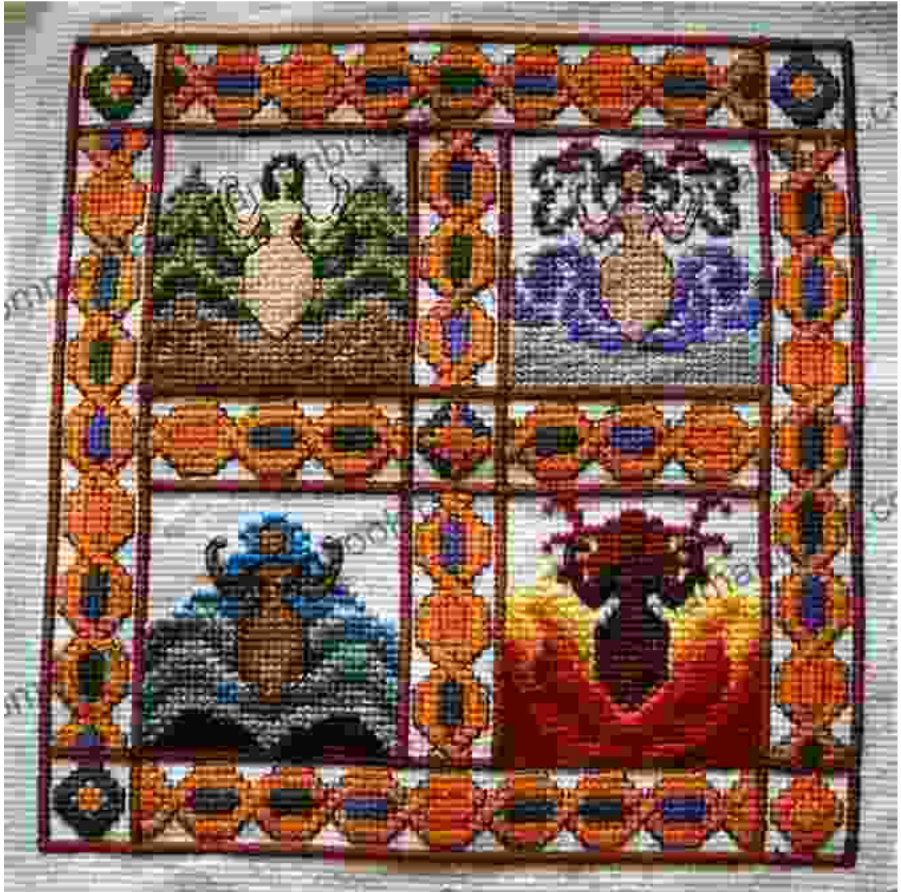
Mother Goddess Counted Cross Stitch Pattern